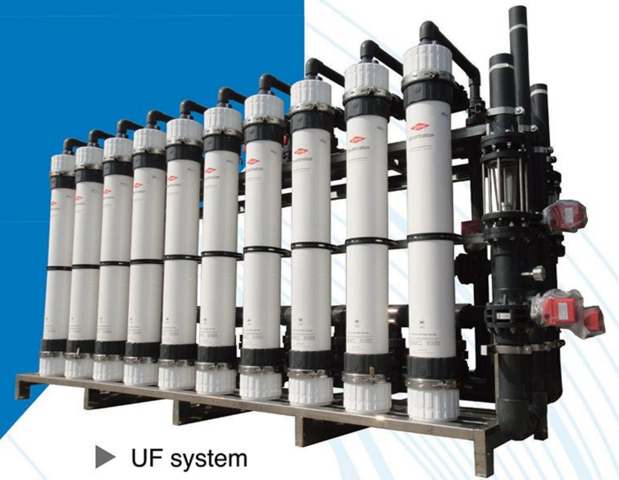
► UF system