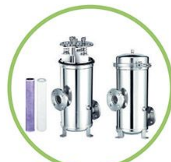
Filter Stainless Housing