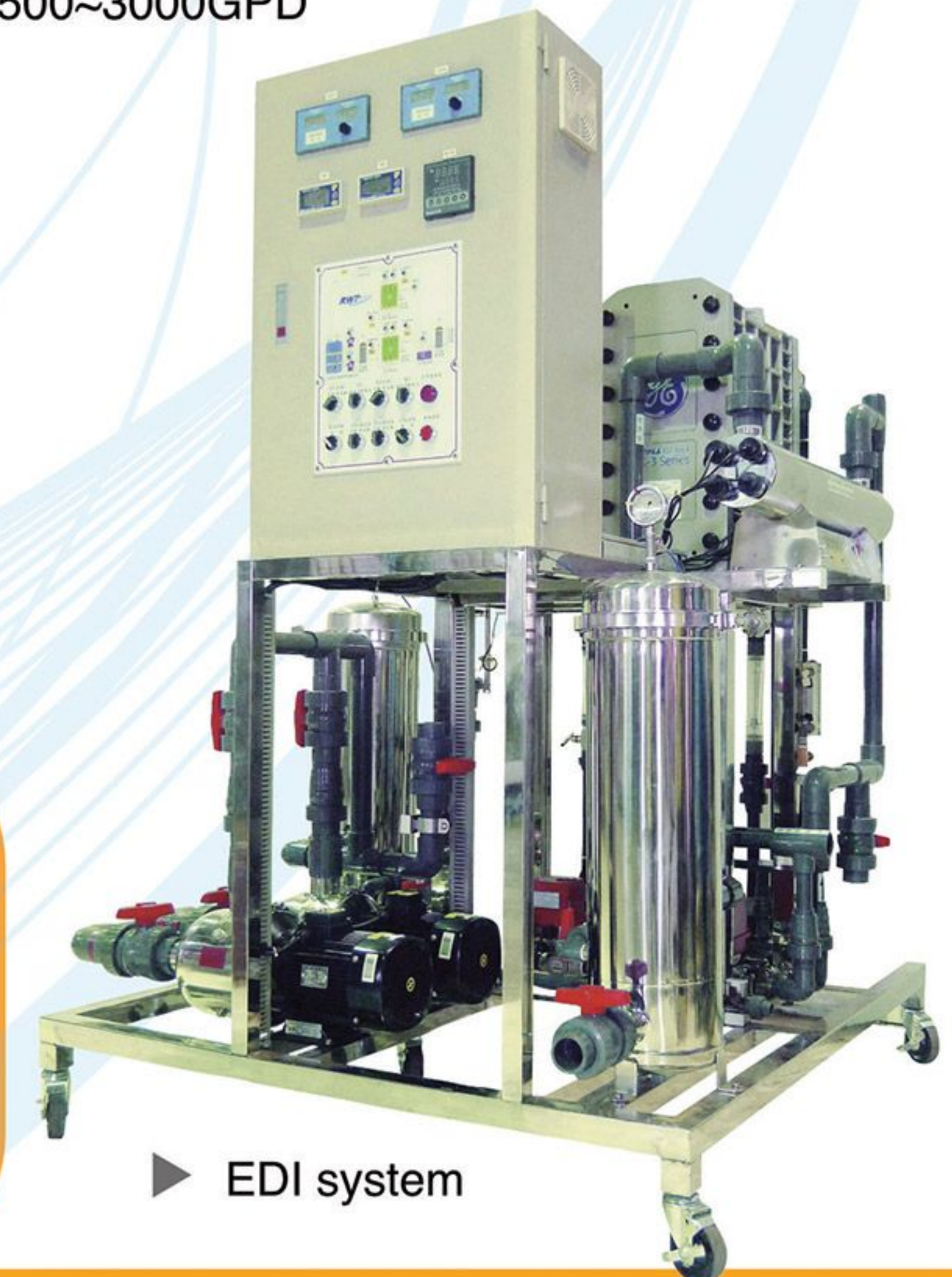
► EDI system