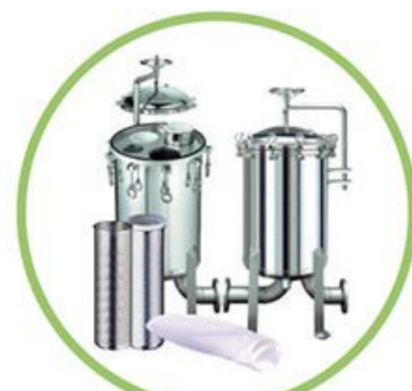
Bag Filter Housig