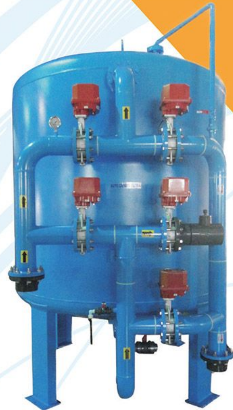
► Multi-media filtration