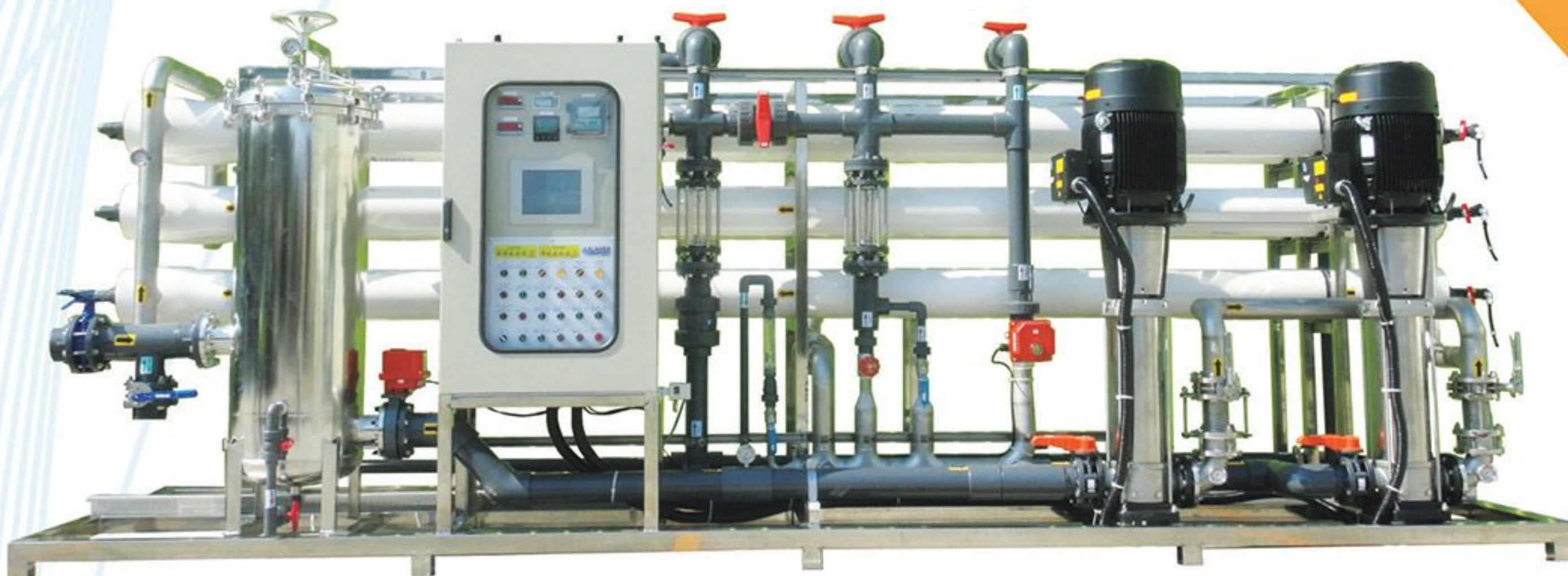
► RO system with PLC & HMI