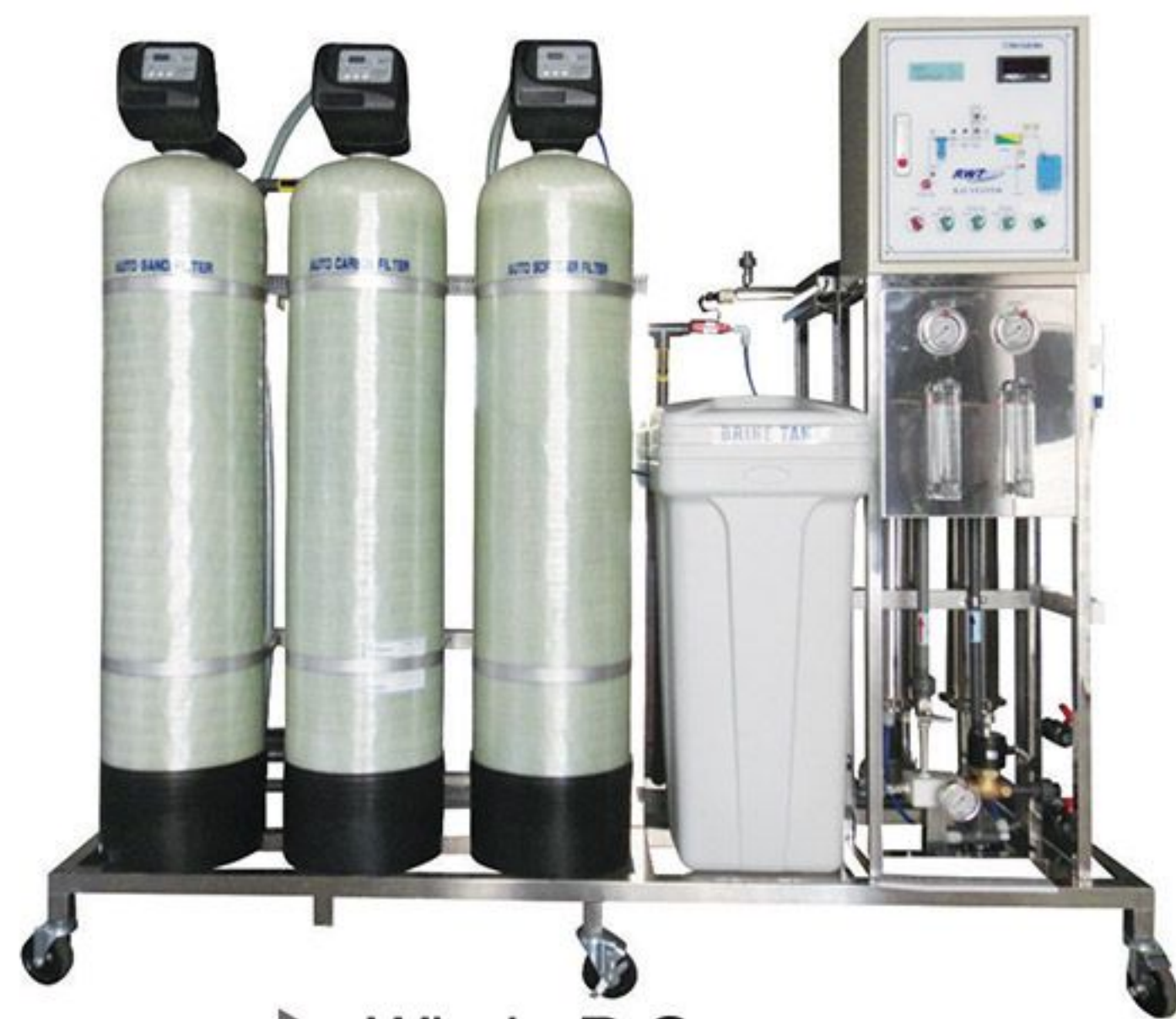
► Whole R.O. system