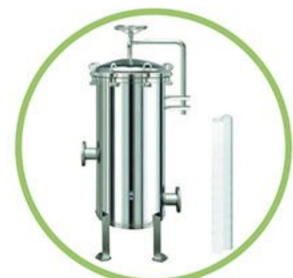
Large Flow Housing