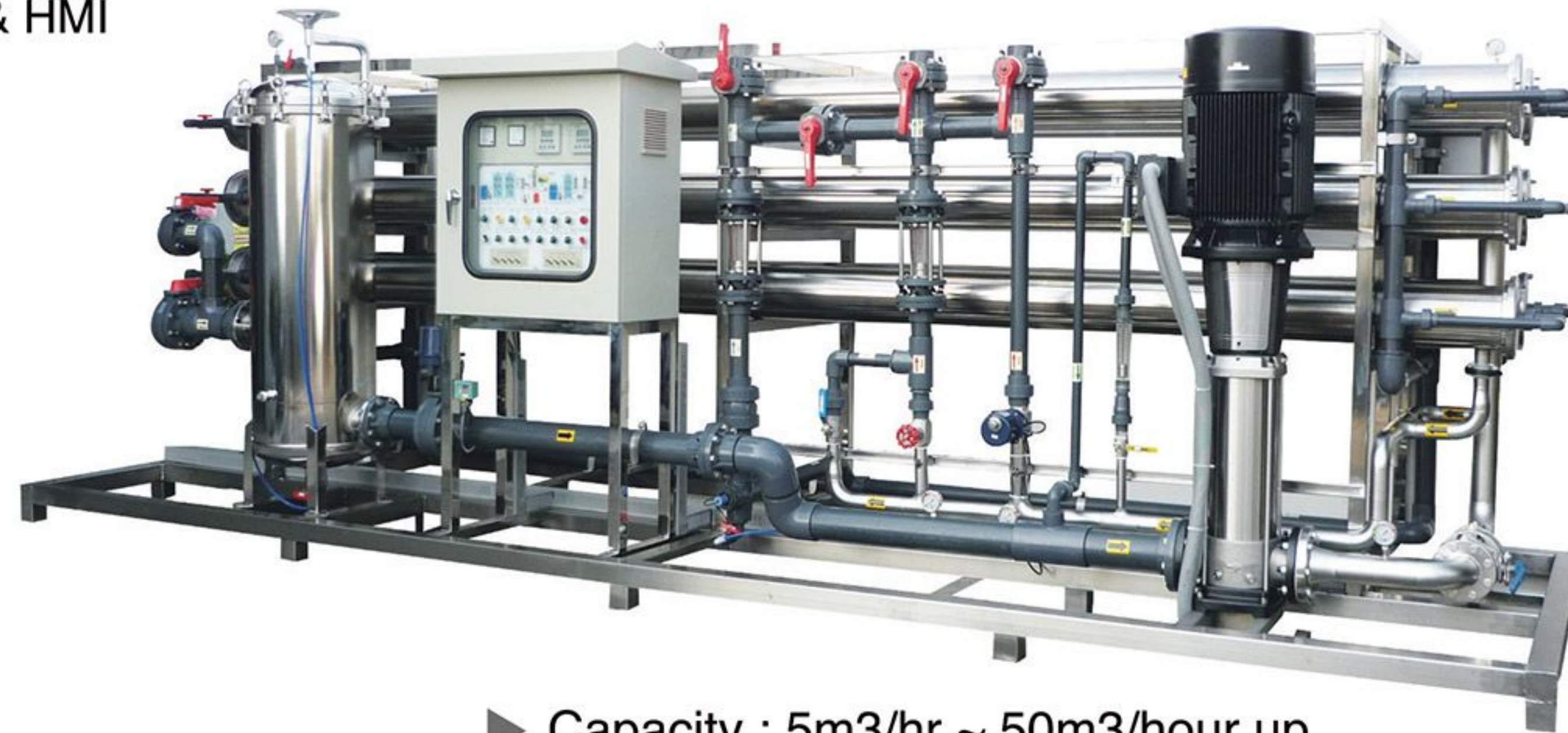
► Capacity : 5m3/hr ~ 50m3/hour up